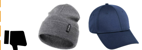
Hoodies, hats, beanies, caps, or wooly hats are not allowed in school.