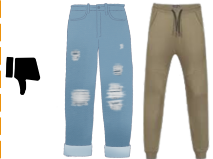
Ripped Jeans/Sweat Pants